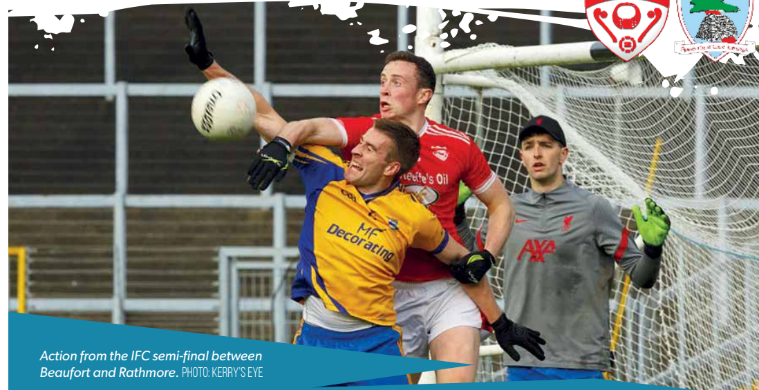
Action from the IFC semi-final between Beaufort and Rathmore.

Then we had the break from early September until last weekend when they beat Beaufort with ease by 2-12 to 1-7 although they made a slow start. But a John Moynihan goal set them