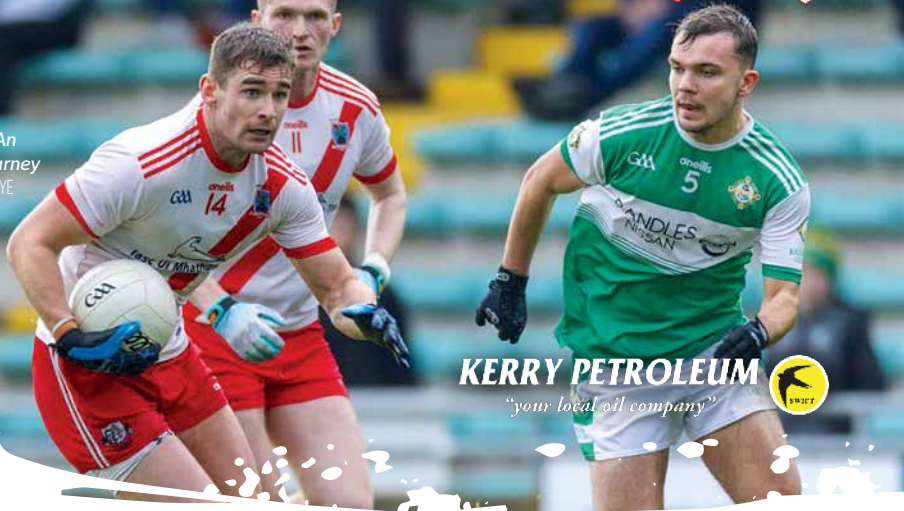
Action from the IFC semi-final between An Ghaeltacht and Killarney Legion.