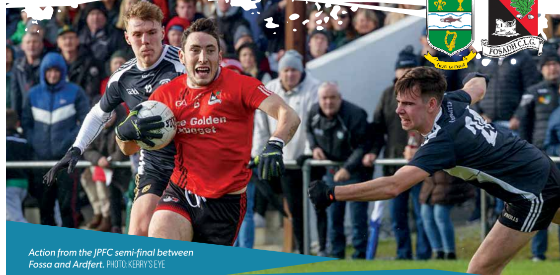
Action from the JPFC semi-final between Fossa and Ardfert.